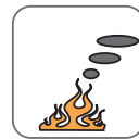
Low Corrosivity EN 50267-2-2/NF C32-074 IEC 60754-2/NF C20-453