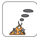
Low Smoke Emission IEC 61034/NFC20-902 EN 50268/NF C32-073