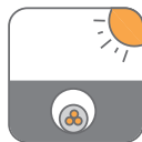
Laid In conduit