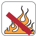
Flame Retardant NF C32-070-2.1(C2) IEC 60332-1/EN 50265-2-1