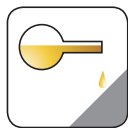
Acid & Alkaline Resistant